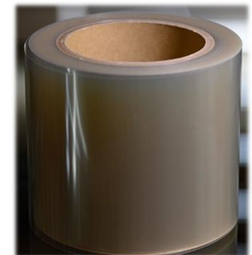
Thickness: 20 ~ 30 \mu\text{m}