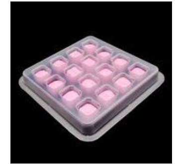
Sponge Form in various colors